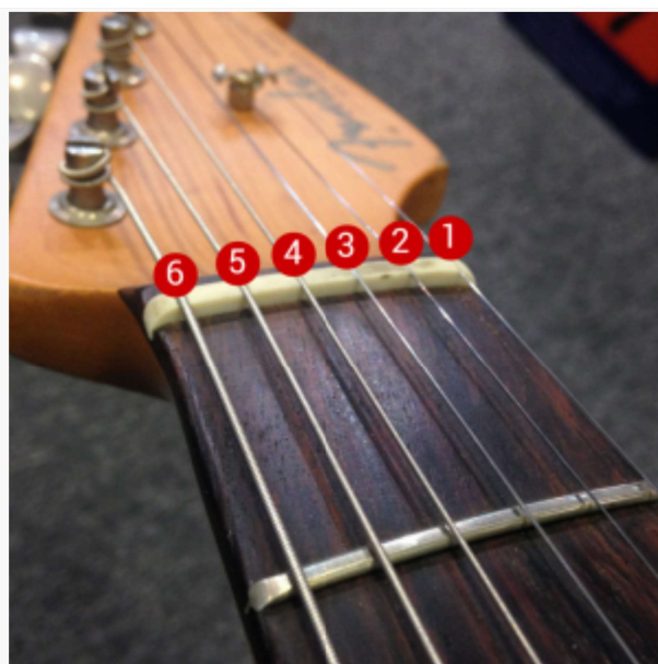
The strings of the guitar numbered.

So, if you make a logical jump, you'll realize that the strings in between are just numbered 1-6 as in the picture below: